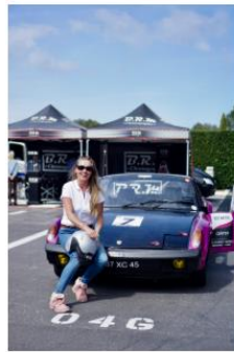
A Lady in Classic